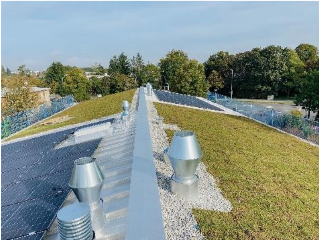
The innovative growth mat of the green roof is very lightweight and can store up to 60 liters of water per square meter.